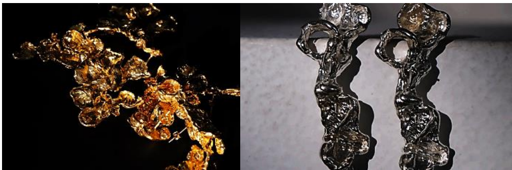
Figure 2. Luwih Jewelry Products

Through the Luwih Jewelry collection, Atma aims to encourage women to be bolder, more confident, and to embrace their uniqueness through accessories that reflect their character and elegance. The importance of jewelry in self-expression and social hierarchy makes this sector not only an economic commodity but also a medium for cultural preservation that holds deep philosophical value for society. Through global collaboration strategies and the strengthening of its digital branding, Atma aims to make Balinese jewelry a cultural icon that anyone around the world can wear and take pride in, without losing its local identity. Theoretically, a failure to integrate local values into digital platforms could cause Bali's silver SME products to lose their cultural identity due to the pressures of a global market that tends toward uniformity and mass production. Therefore, the urgency of this research lies in the need to formulate strategies in which digital technology serves not only as a sales tool but also as a medium for preserving the values of Tri Hita Karana, ensuring they remain relevant to modern consumers.