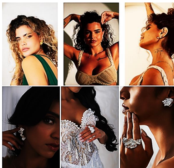
Figure 7. Collaboration with Public Figure

The revenue of Rp 15,390,000 in April 2025, while seemingly modest for a global scale, represents a high conversion rate relative to the startup's low marketing expenditure. Analytical observation of their Instagram engagement suggests that the 'storytelling' approach yields a deeper niche-market penetration compared to conventional promotional methods. This confirms that for tourism-based SMEs, cultural narrative is a more potent driver of sales than price competition.