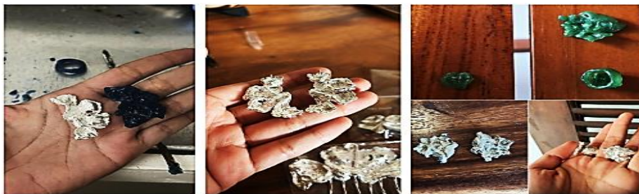
Figure 5. Luwih Jewelry's Abstract Floral Design Source: Researchers (2025)