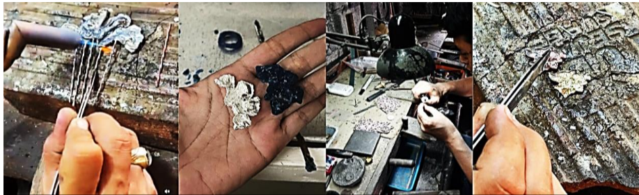
Figure 4. The Design Process for Luwih Jewelry

Research findings indicate that the key to the success of Atma Silver Jewelry's business transformation lies in the launch of the "Luwih Jewelry" product line. The name "Luwih," derived from the Balinese language and meaning "more" or "superior," fundamentally reflects the company's vision to create high-quality jewelry that exceeds expectations. This innovation focuses not only on aesthetics but also on enriching cultural and philosophical values.