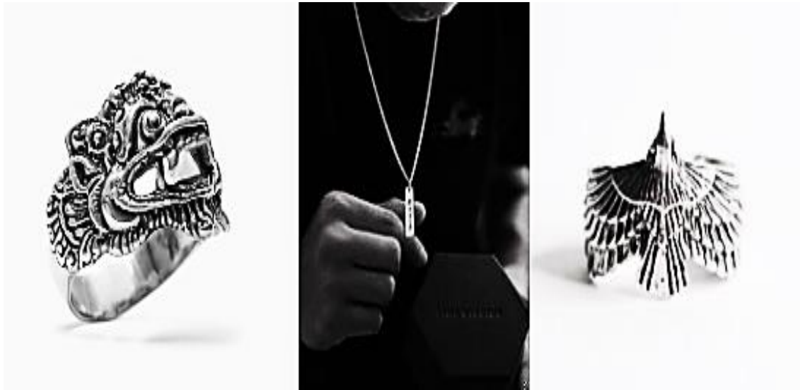
Figure 1. Atma Silver Jewelry Products

philosophy behind each design. However, a significant gap remains between theoretical concepts of cultural entrepreneurship and their practical application in the face of modern competition. Although (Rajiv & Widodo, 2023) state that the integration of traditional assets is crucial, the reality on the ground shows that many SMEs in Celuk fail to achieve this integration because they are too rigidly tied to standardized traditional designs. Atma Silver, through its Luwih Jewelry line, seeks to address this tension by adopting an approach aligned with the concept of culture-based entrepreneurship and local wisdom.