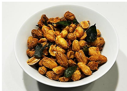
Figure 4. Kacang Kapri Daun Jeruk

Kacang Kapri, in the context of Bali and in this study, refers to a distinctive Balinese culinary souvenir and does not refer to snow peas or not to legumes such green peas. Kacang kapri is a type of peanut cooked with garlic, generally characterized by a savory and slightly spicy flavor. In this research, the author used kacang kapri with kaffir lime leaves, which is also commonly found in the market. Balinese kacang kapri daun jeruk is well known for its savory and mildly spicy taste, its crunchy texture, and the aromatic sensation of kaffir lime leaves. This snack is often found in various local Balinese dishes, such as mixed into sambal or main dishes, thereby playing an important role in Balinese traditional cuisine. The distinctive characteristic of kacang kapri daun jeruk, a Balinese culinary souvenir, is its yellowish color, as it is cooked with garlic and kaffir lime leaves.