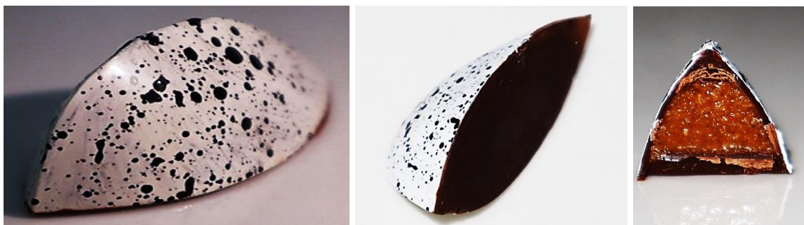
Figure 3. Praline With Kacang Kapri Daun Jeruk: A Distinctive Balinese Souvenir (Dark Chocolate)