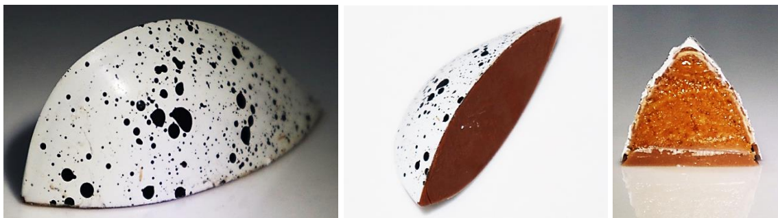
Figure 2. Praline With Kacang Kapri Daun Jeruk: A Distinctive Balinese Souvenir (Milk Chocolate)